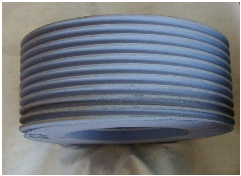
Fig. N°1- Grinding wheel in aluminum oxide

The difference is thus insignificant, indeed it can be completely neglecting the effect of the helix angle of the thread even in the case of grinding wheels with one start .