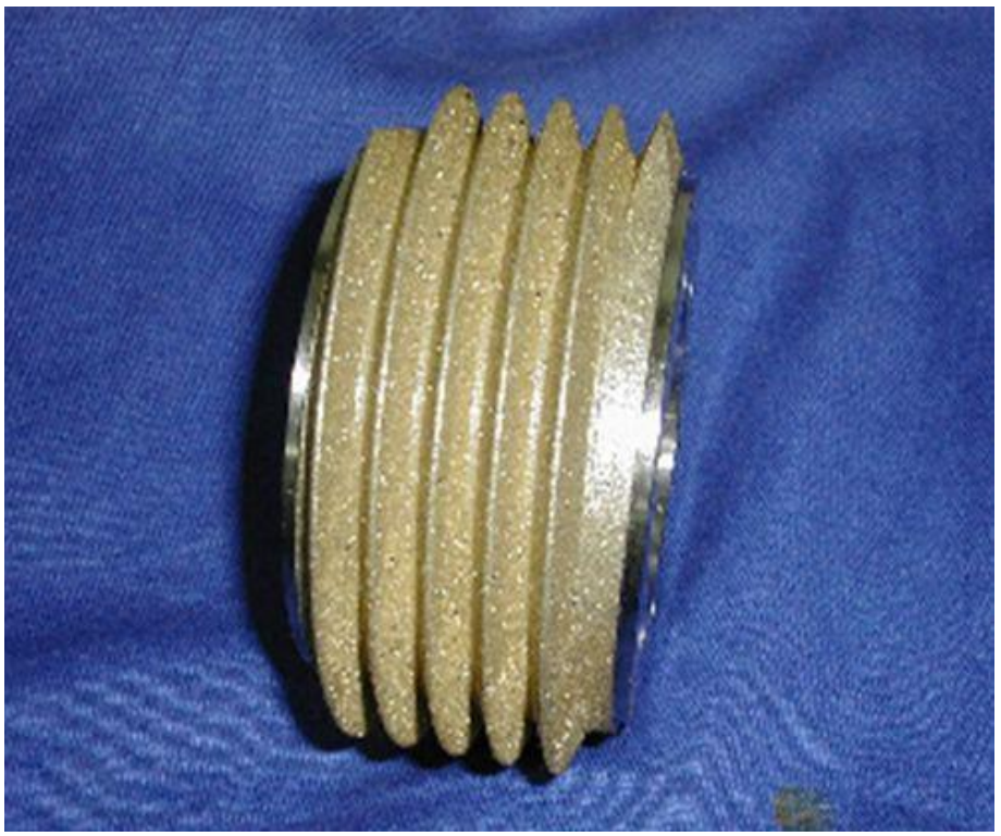
Fig. N°3- Electroplated CBN worm grinding wheel

The correct choice of the number of starts of a worm grinding wheel is of fundamental importance for optimizing the grinding time and the desired quality on the gear. The increase in the number of starts, i , of the grinding wheel, implies a proportional increase of rotation speed of the workpiece and then, with the same feed of workpiece per revolution, a reduction of the grinding time.